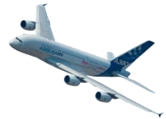
p l a n e