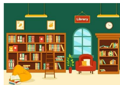
I read books in the library.