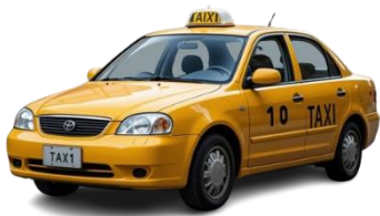
There is a taxi.