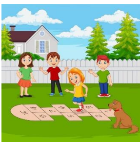
They play in the garden.