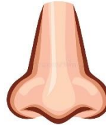
n o s e