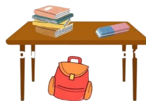
The bag is under the desk.